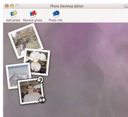
Photo desktop allows you to place a number of pictures on your desktop. It gets its photos from iPhoto. Cool integration, and free, too! While we are on desktops, have you given DeskShade a try? It isn't free but the trial download is fun to play with. Hey, on Technology Saturday, nothing has to be permanent.

Okay, I am one of those who loves to change the desktop pictures and such. Photo Desk Top is a fun program for the like minded. Available at http://www.alwintroost.nl/content/photodesktop/home.xml .